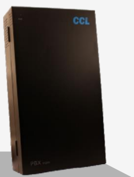
X-Series : 832X & 8120X

Designed, Developed & Manufactured in India