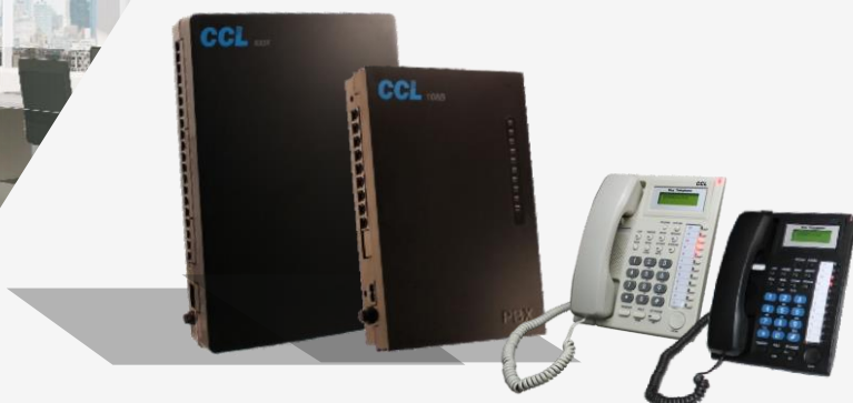
Models from 4 to 500 Extensions